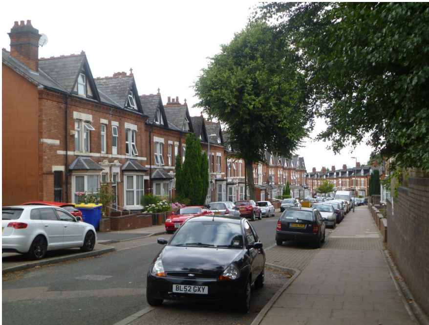
St Albans Road 2014.