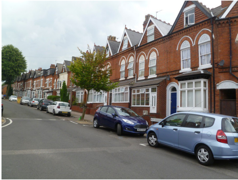
The lower end of St Albans Road 2014.