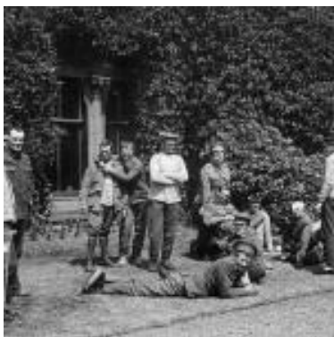
Convalescing in Highbury Hall

The History Group has been very active again this year, undertaking a major project on World War I, focussing on war memorials, the stories of those who fought in the war and conscientious objectors. The project has been extended beyond its original 2014 end date.