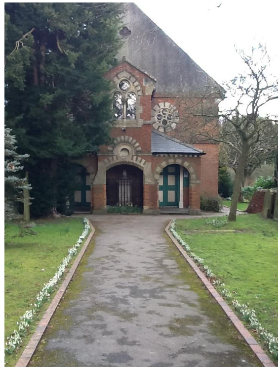
Kingswood Chapel, Packhorse Lane, Hollywood, B47 5DQ. The chapel was built in 1792, following the Priestley Riots.