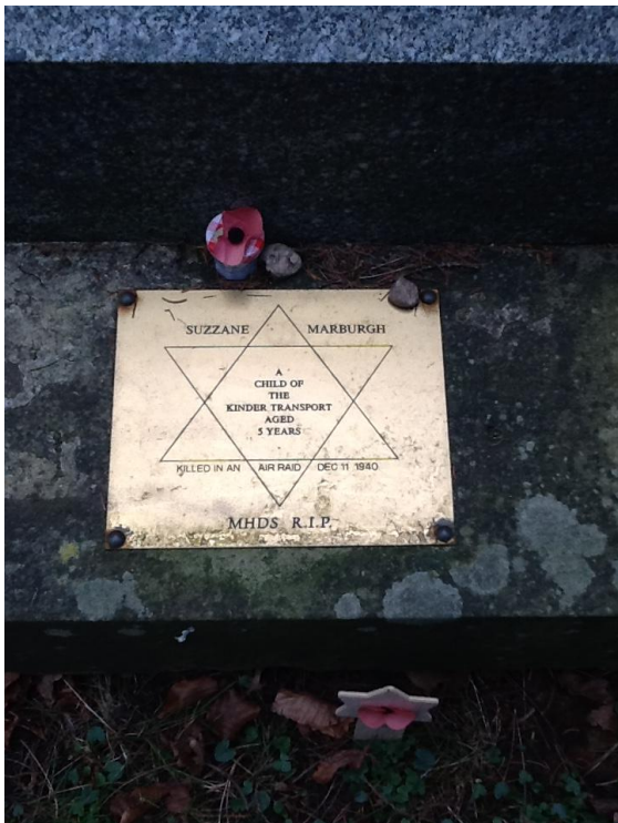
Memorial to Suzzane Marburg at Kingswood Chapel