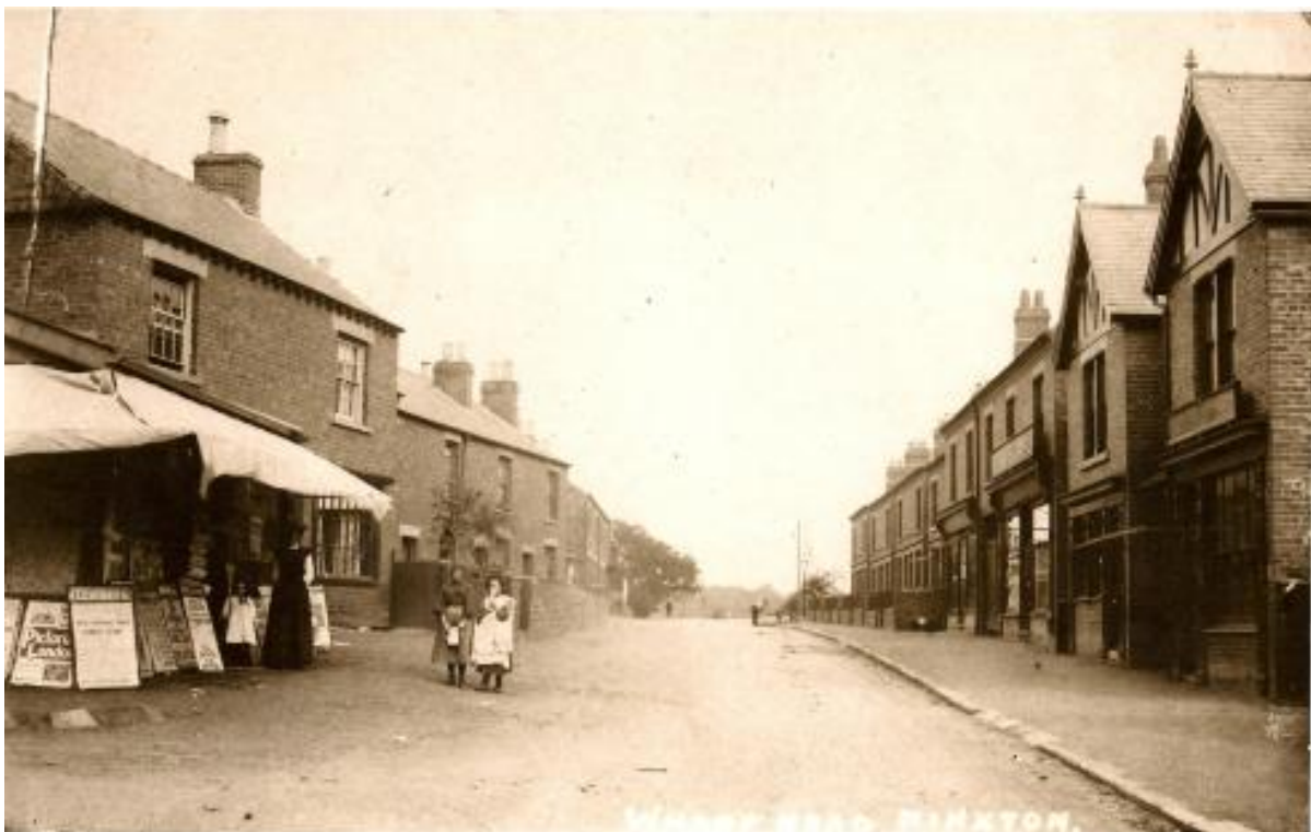
Figure 1: An early photograph of Wharf Road, Old Pinxton