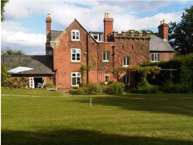
Figure 3: The Manor, Burghill, Herefordshire