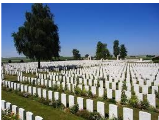
Figure 5: (left) Moseley Ashfield Cricket Club WW1 memorial (right) St Mary's Church, Moseley WW1 memorial (bottom left) AIF Burial Ground, near Flers