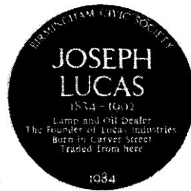
A Plaque marking the site of the Lucas Works

Joseph had no formal education, in common with more than fifty per cent of children born at that time. He attended the Sunday School run by George Dawson at the Graham Street Chapel. Here he was taught basic reading and writing skills, and he later attributed his progress and prosperity entirely to George Dawson.