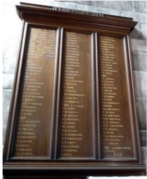
Figure 3: (Above) Thiepval Memorial (Right) St Mary's Church WW1 Memorial, Moseley