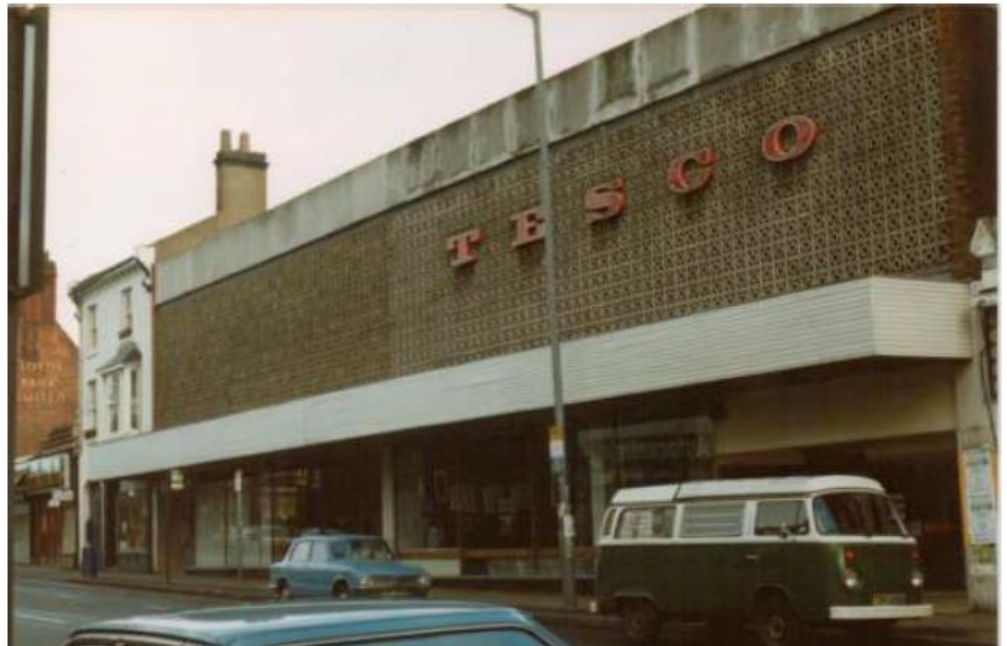
Photo of Tesco in Moseley from 'The Collection'

We would welcome any photos or memories of this event.