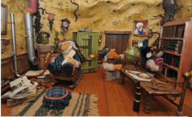
Great Uncle Bulgaria, Bungo and Stepnev 1

I remember taking my very young children to the opening of Tesco in Moseley Village in the early 1970s. The store was huge for the village and was being opened by 'The Wombles', my children's favourite TV Programme at the time. It was a scrum! I think every local parent of children under five had turned up!