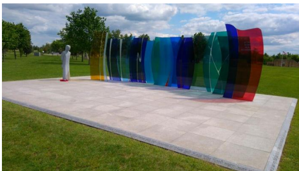
National Memorial Arboretum - Royal Navy Memorial

On 24 May a visit took place to the National Memorial Arboretum near Alrewas, organised by the History group. The Arboretum, which lies within the National Park was begun in 1997 and was officially opened in May 2001. It was developed on disused gravel workings at the confluence of the Rivers Tame and Trent and now occupies 150 acres containing 30,000 trees and more than 300 memorials commemorating those who have given their lives in service to the country or have otherwise died in tragic circumstances. The sheer size and scope of this national centre of Remembrance is impressive and although guided tours