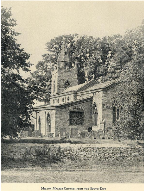
MILTON MALSOR CHURCH, FROM THE SOUTH-EAST