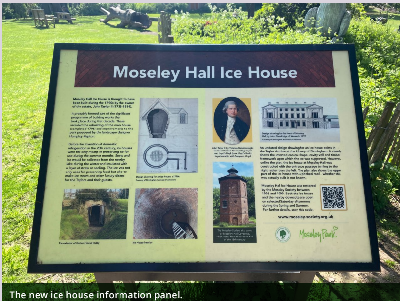
The new ice house information panel.