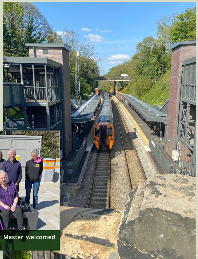
Grandchildren of last Station Master welcomed to the station reopening.

We continue our membership of Birmingham Heritage Forum, West Midlands Amenity Societies Association and Civic Voice which, because of lack of funds, is now being run by its trustees with no administrative staff.